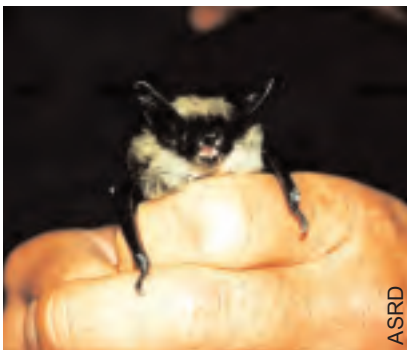
The long-eared bat

Some people also believe that bats have rabies. Like all mammals, bats can contract rabies but few ever do. “Bats don’t show aggressive