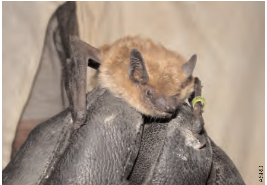
Bats should be welcomed residents of Alberta woodlots