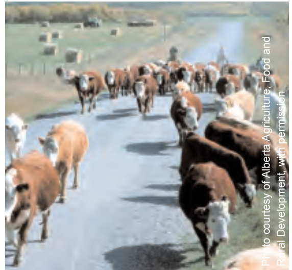
Home-grown beef consumption actually increased in Canada in spite of a domestic case of BSE

CFA and its partners in on-farm food safety have been proactive in promoting Canada's food safety initiatives at the national and international levels. We work extensively trying to do what we can to get our message out and to correct incorrect messages