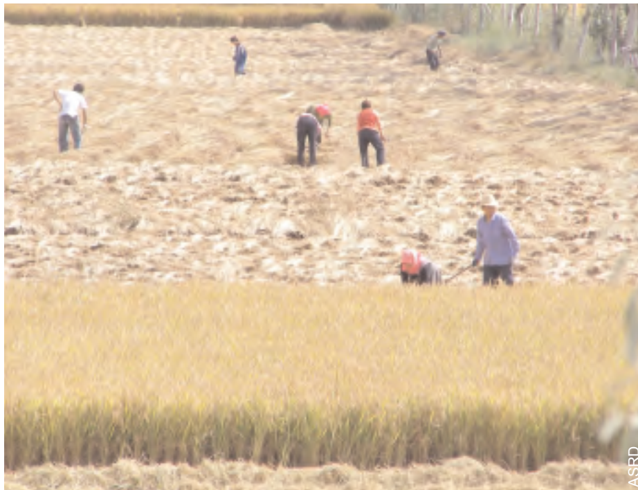
Rice harvesting in Ningxia, China

The plan will address goals of increased environmental protection and grassland health, reduced soil erosion and desertification, balanced