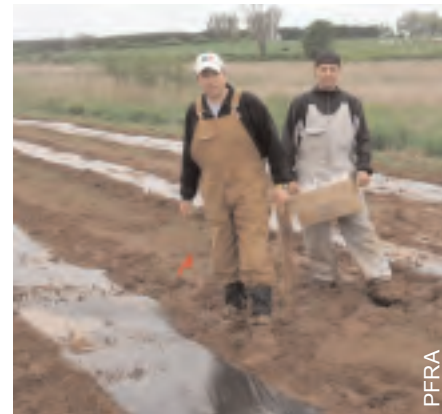
AAFC technicians at new biomass riparian planting project

Furthermore, the economic feasibility of willow biomass and conversion technologies are being studied by researchers with Natural Resources Canada (NRCan).