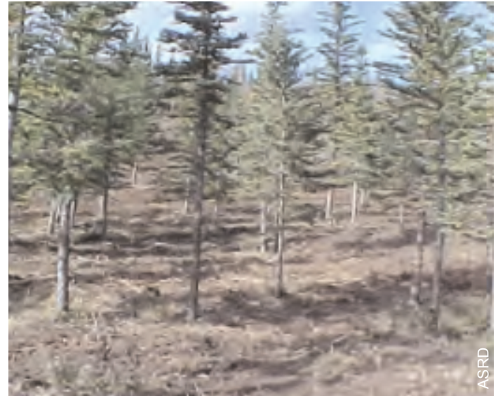
Before and after: FireSmart activities involving the removal of fuels such as brush or over-mature trees