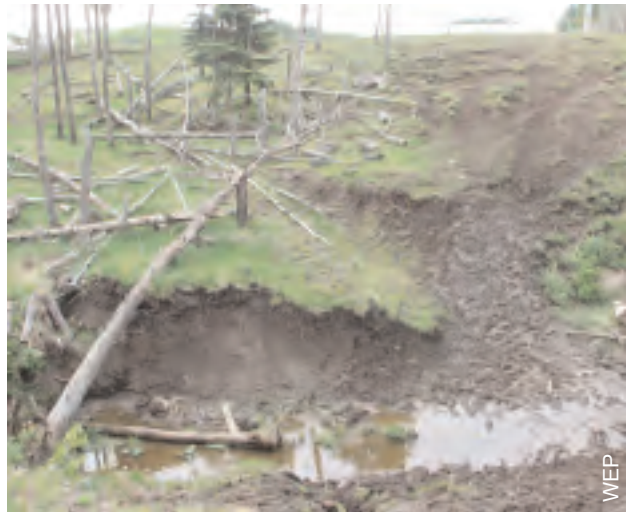
Overuse leads to unhealthy watershed

Daishowa-Marubeni International Ltd. (DMI), Boucher Bros. and Alberta Sustainable Resource Development donated trees. A combi-